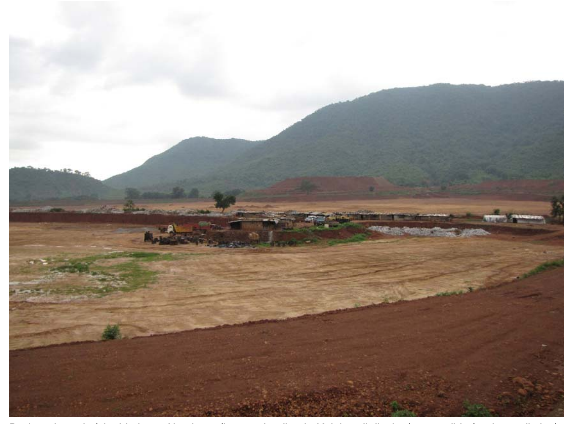
Red mud pond of the Vedanta Alumina refinery at Lanjigarh, Kalahandi district (responsible for dust pollution)

The OSPCB contacted Vedanta Alumina directing it to explain why the OSPCB's directions had not been complied with, stating that it did not consider that the company had comprehensively addressed these concerns in its response. Vedanta Alumina sent a response to the OSPCB in July 2008, stating that all parapet walls in the process areas had been raised; parts of the process units were being lined with steel; the recirculation system for ash pond filtered water was ready; and the clean water pond had been repaired.