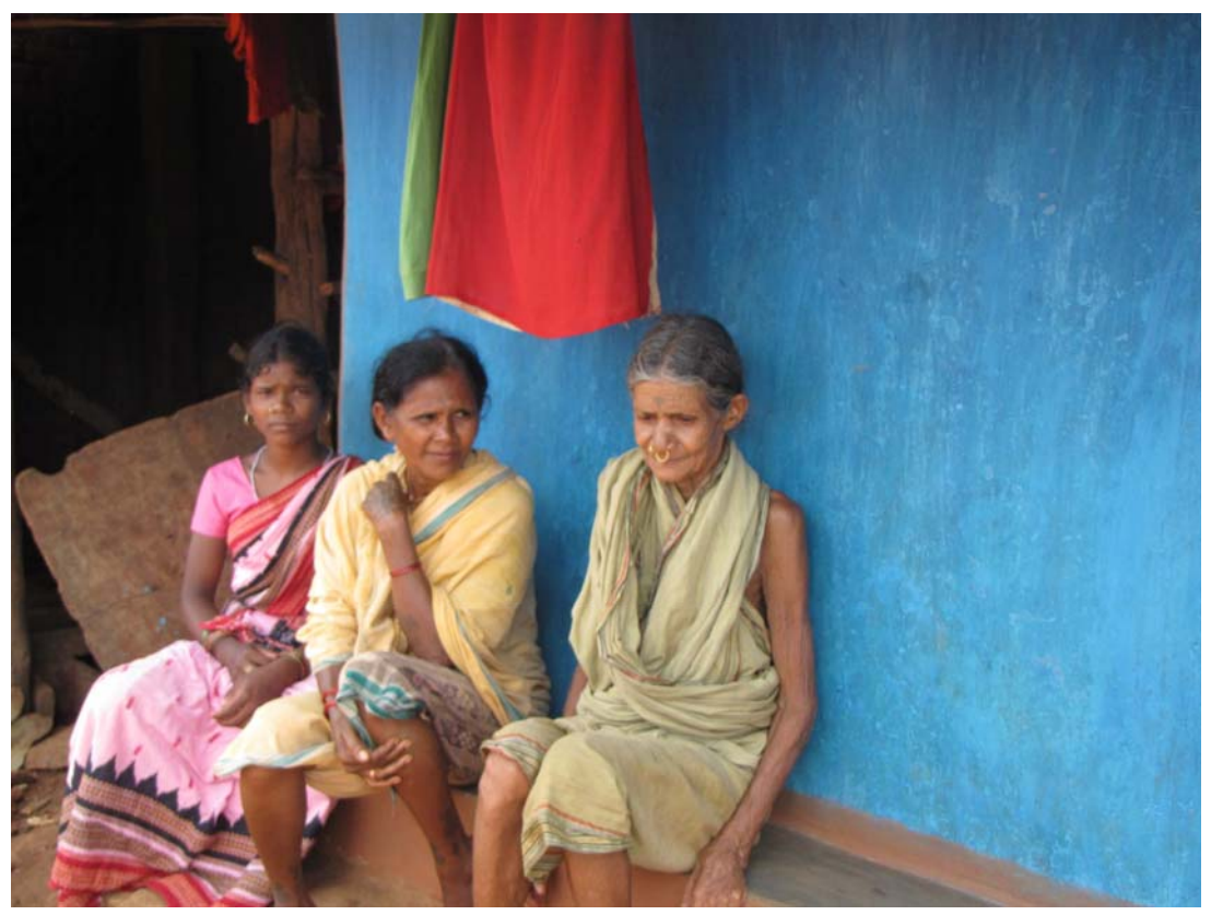
Kutia Kondh women in Kendubardi village, district Kalahandi