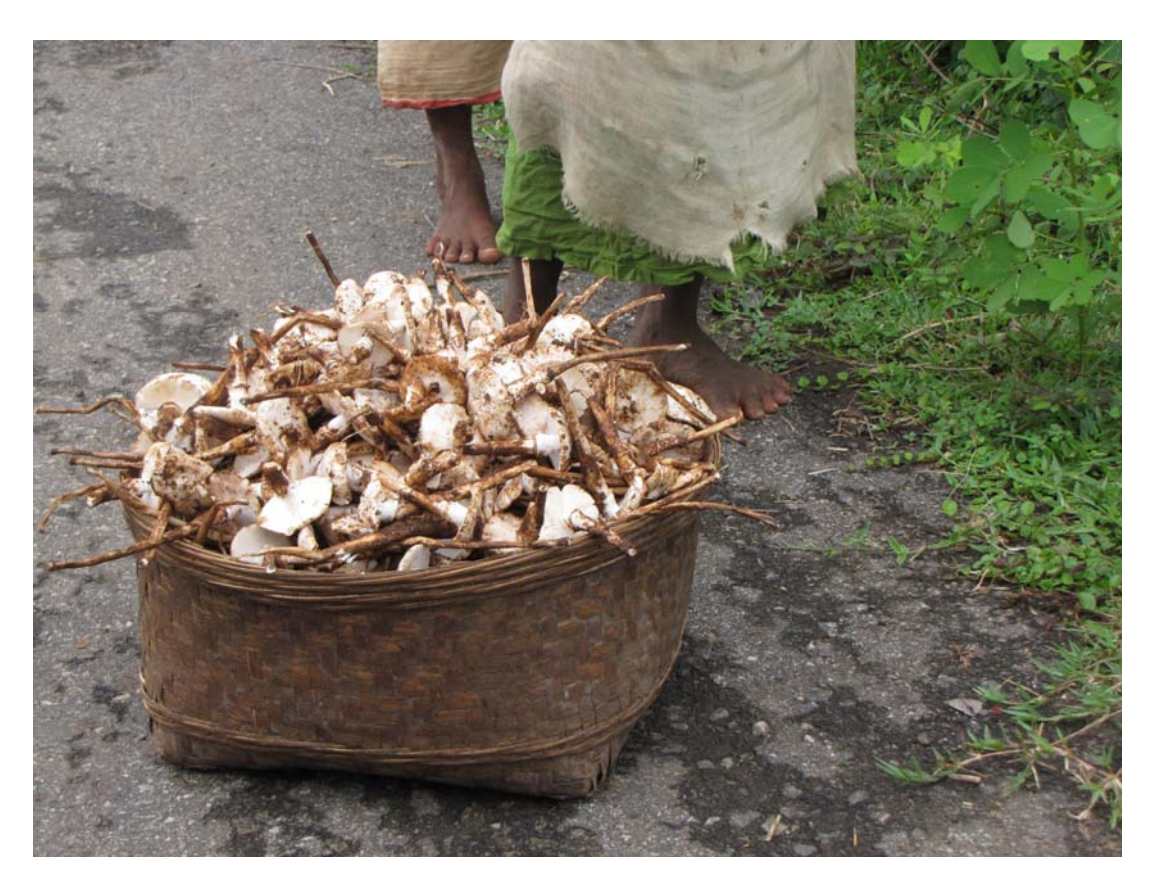
Dongaria Kondh women with mushrooms collected from the forest, near Parsali, district Rayagada