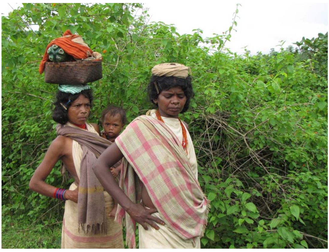
Dongaria Kondh women with mushrooms collected from the forest, near Parsali, district Rayagada