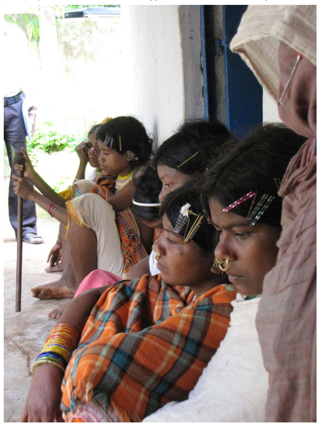
Dongaria Kondh girls, Lakpadar village, district Rayagada

forest for their livelihoods. Since the forest resource satisfy the bulk of their material needs, only four households out of 50 supplement their income with wage labour.