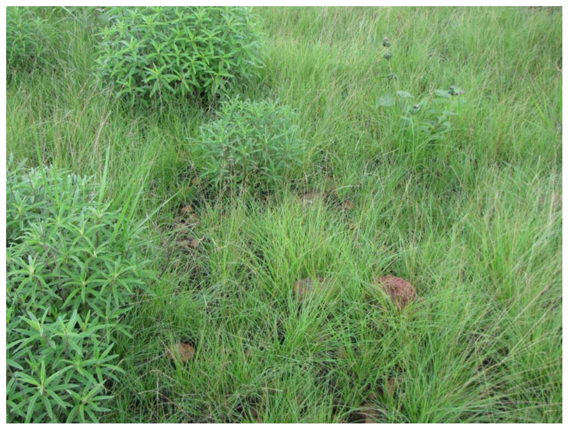
Grasses and herbs on the plateau, the Proposed Mining Lease area

The grasses are breeding and fawning ground for Four Horned Antelope ( Tetracerus quadricornis ), Barking Deer ( Muntiacus muntjac ), Indian Hare ( Lepus nigricollis ) as well as Spotted Deer ( Axis axis ). The wild life productivity of this habitat is particularly high because it provides the valuable "edge effect" to wild animals with open grasslands as feeding space and the neighbouring trees for shelter and escape.