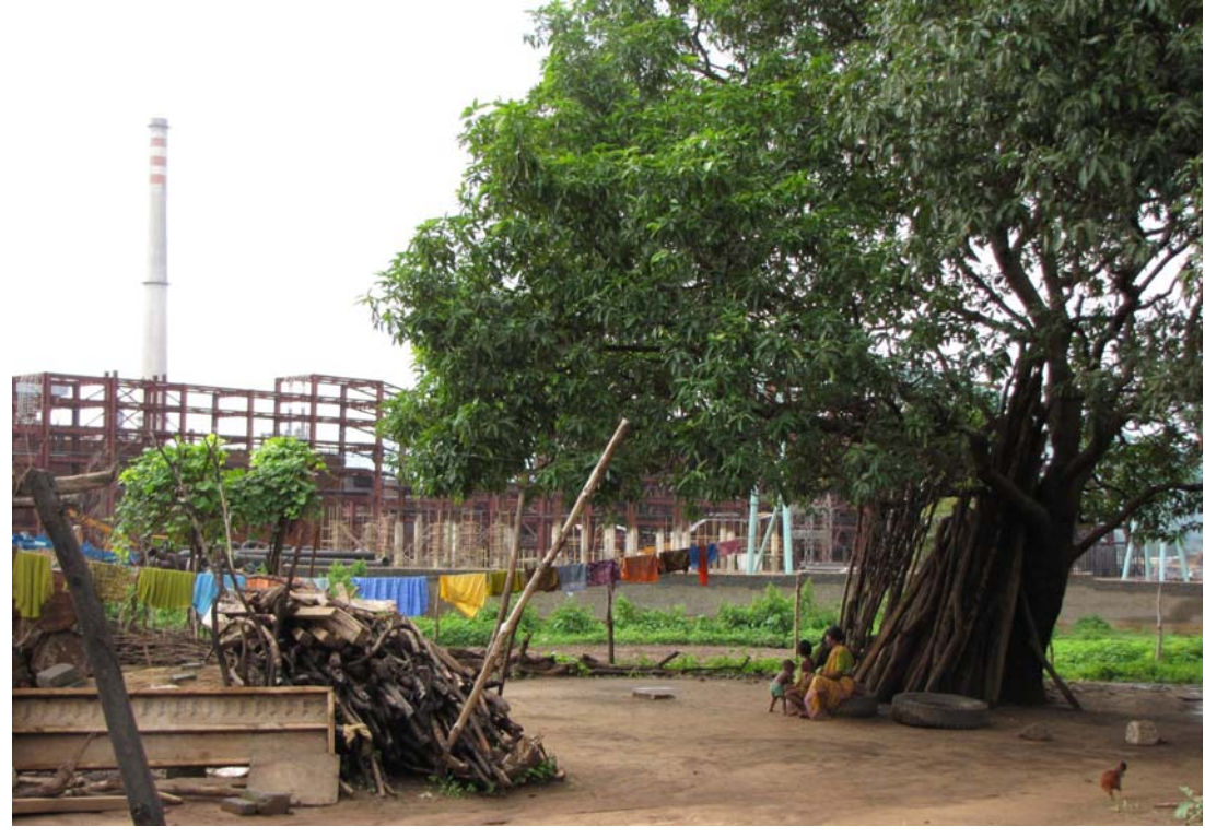
Bandhaguda village, district Kalahandi, adjoining the refinery: dispossessed yet not 'displaced'

In Rengopali with a total number of 96 households, twentyfour households each have one member who is casually employed outside the refinery. The income from this employment is low and unstable (averaging Rs 4,000 to 5,000 per month) and is not enough for regular sustenance. According to Lingaraj Majhi, a few household used their compensation money to buy land in nearby villages such as Patarguda. However, they were coerced into giving it up it by the villagers there. As a result, no one at present has any access to agricultural land. In Bandhaguda, Moti Majhi (a Kutia