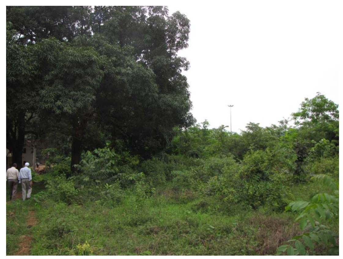
Village forest (gram jogya jangal) illegally taken over and enclosed by the Vedanta refinery