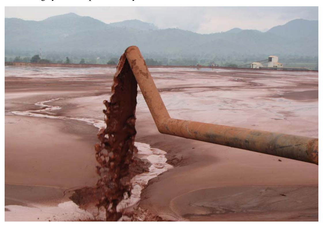
Red mud pond of the Vedanta Alumina refinery at Lanjigarh, Kalahandi district (responsible for dust pollution)

In a more detailed inspection two months later, however, the OSPCB found the water in the storm water drains inside the plant, which discharged to river Vamsadhara, had a pH value of 9.46.<sup>63</sup> It stated that this pH value was possibly due to alkali contamination linked to spillages from the plant process areas. It noted that the online monitoring system for pH had not yet been installed in all storm water drains.