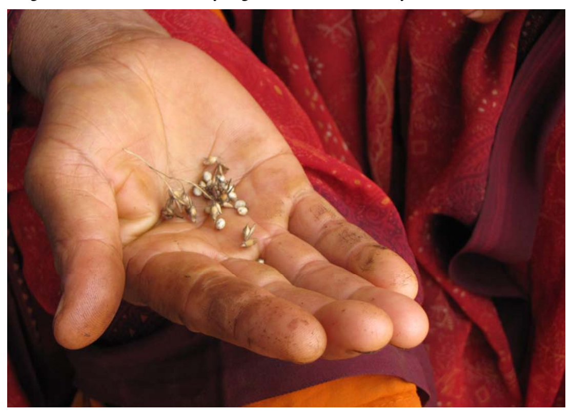
Cereals grown on forest fields by Kutia Kondh in Kendubardi village, district Kalahandi

worked for wages.<sup>25</sup> The Dongaria Kondh we met were proud of their economic independence and freedom from want. Over and over again, they attributed their wellbeing and contentment to the Niyamgiri hills and their bounty.