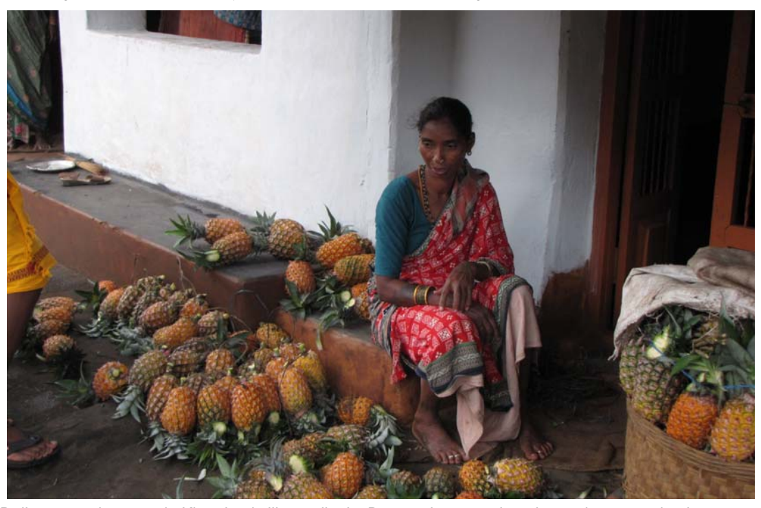
Dalit men and women in Khambesi village, district Rayagada, preparing pineapples grown by the Dongaria Kondh residents of the villages for sale in the local market