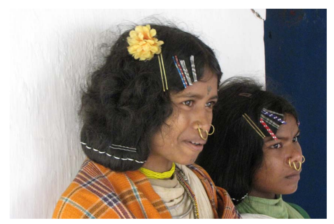
Dongaria Kondh girls, Lakpadar village, district Rayagada