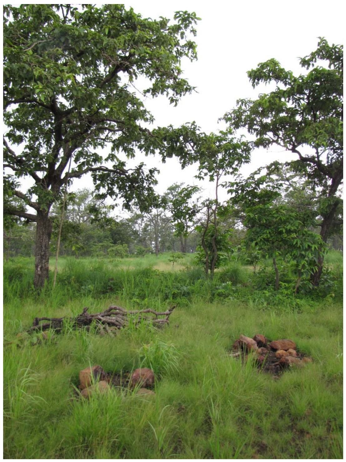
View of the Proposed Mining Lease area