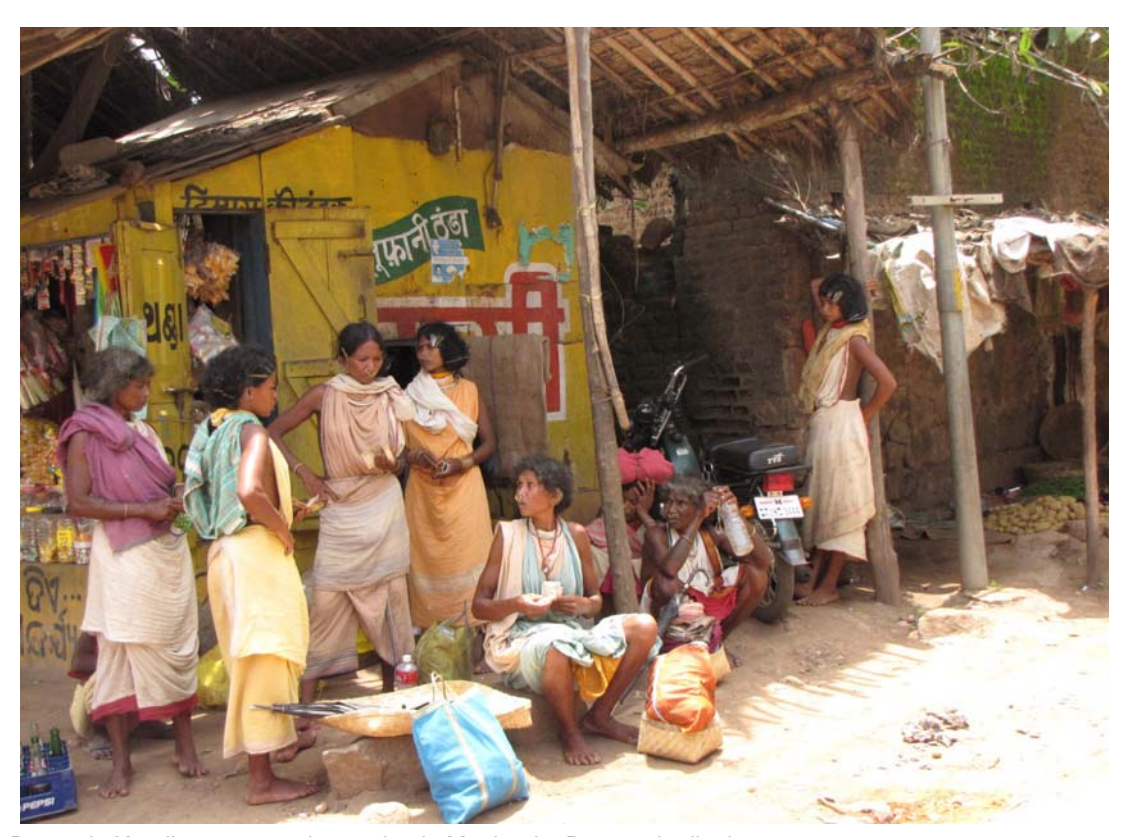
Dongaria Kondh women at the market in Muniguda, Rayagada district

All Dongaria Kondh that the Committee spoke to expressed their strong attachment to the Niyamgiri hills, their stewardship of the land, and the legitimacy of their rights