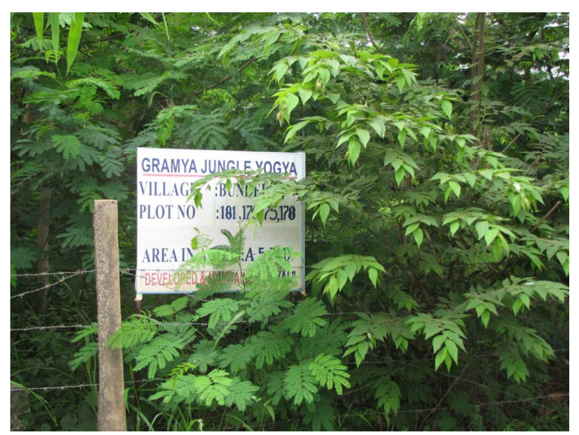
Village forest (gram jogya jangal) illegally taken over and enclosed by the Vedanta refinery

Almost all the villagers from Rengopali and Bandhaguda near the refinery on 19 July, 2010, reported severe discontent with the Vedanta refinery. Their specific allegation was that the refinery had taken over their village forest lands and denied access to them. They claimed that the factory has cornered and marginalized them with the knowledge of the district administration. The latter did not intervene to support them, and might have even supported the refinery's unfair action. The MP of Kalahandi, Shri Bhakta Charan Das, in a later meeting with the Committee stated that the company has illegally occupied forest lands belonging to tribal and Dalit villagers. He claimed that the clearances granted to the company by MoEF under the EPA are illegal, because these were granted on the basis of false information.