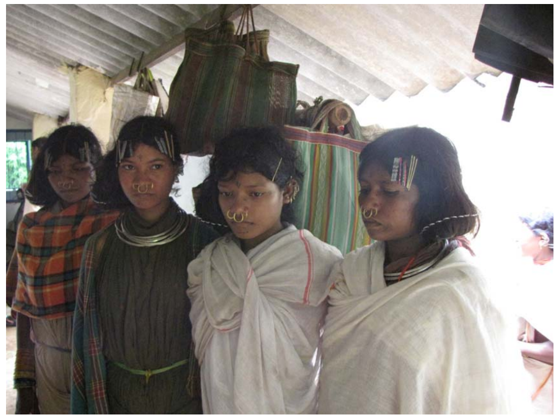
Dongaria Kondh girls, Lakpadar village, district Rayagada

While the Kutia Kondh inhabit the foothills, the Dongaria Kondh live in the upper reaches of the Niyamgiri hills which is their only habitat. In the polytheistic animist worldview of the Kondh, the hilltops and their associated forests are regarded as supreme deities. The highest hill peak, which is under the proposed mining lease area, is the home of their most revered god, Niyam Raja, 'the giver of law'. They worship the mountains ( dongar from which the Dongaria Kondh derive their name) along with the earth ( dharini ). These male and female principles come together to grant the Kondh prosperity, fertility and health. As Narendra Majhi, a Kutia Kondh from Similibhata village, said, 'We worship Niyam Raja and Dharini Penu. That is why we don't fall ill'. Sikoka Lodo, a Dongaria Kondh from Lakpadar village said, 'As long as the mountain is alive, we will not die'. Dongaria Kondh art and craft reflect the importance of the mountains to their community—their triangular shapes recur in the designs painted on the walls of the village shrine as well as in the colourful shawls that they wear.