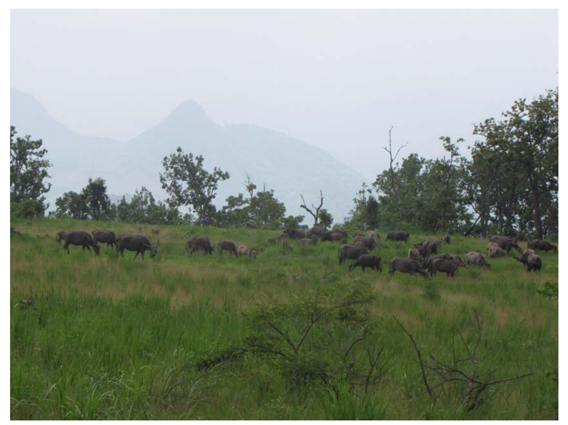
Buffaloes grazing in the Proposed Mining Lease area, showing Dongaria Kondh villagers' customary use of the forests on the plateau. Buffalo sacrifice is a central element of Dongaria Kondh religious practice