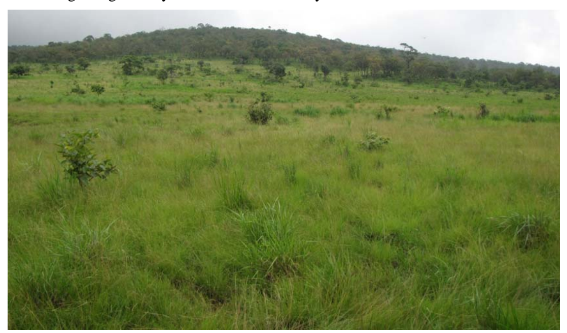
The Niyamgiri hills, Orissa: Mining Lease Area

laxa, Themeda arundinacea and Cymbopogon martini. This type of grassy meadow eco-system is usually found on lateritic zones on upper reaches at about 700 meters and above. The fact that this eco-system is mostly prevalent in Dongaria Kondh inhabited areas suggests that besides natural geological and climatic factors, human factors such as burning for grasses and collection of Minor Forest Produce (MFP) practiced over a long period by the hill tribe may have also been a determining factor. Fires are an annual feature leading to establishment of grasslands which leads to increased grazing both by wild herbivores and by cattle.