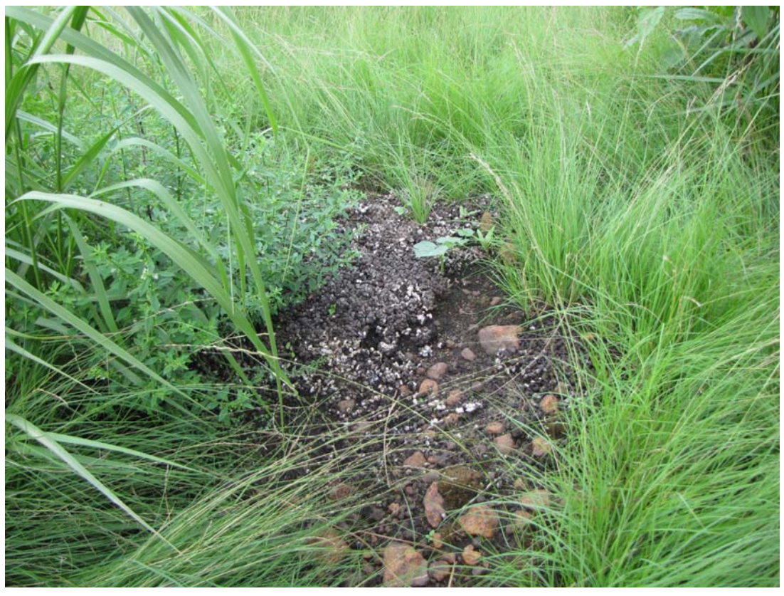
Decomposing scat showing the presence of wildlife in the Proposed Mining Lease area