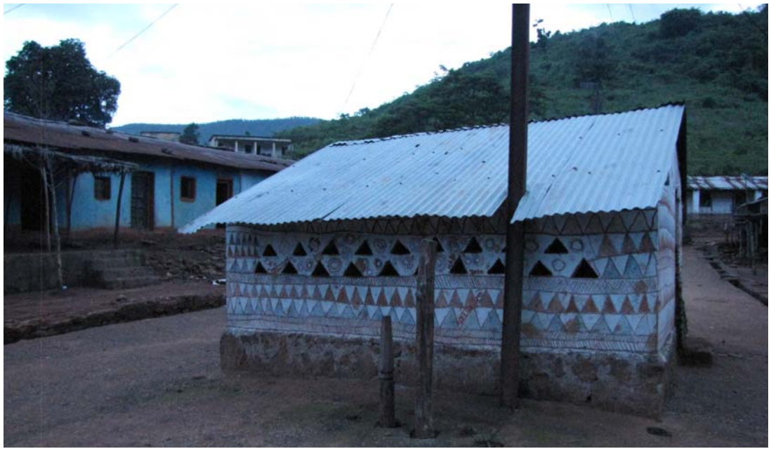
Dongaria Kondh prayer-house walls, showing the triangular motif signifying the Niyamgiri hills, in Kurli village, district Rayagada