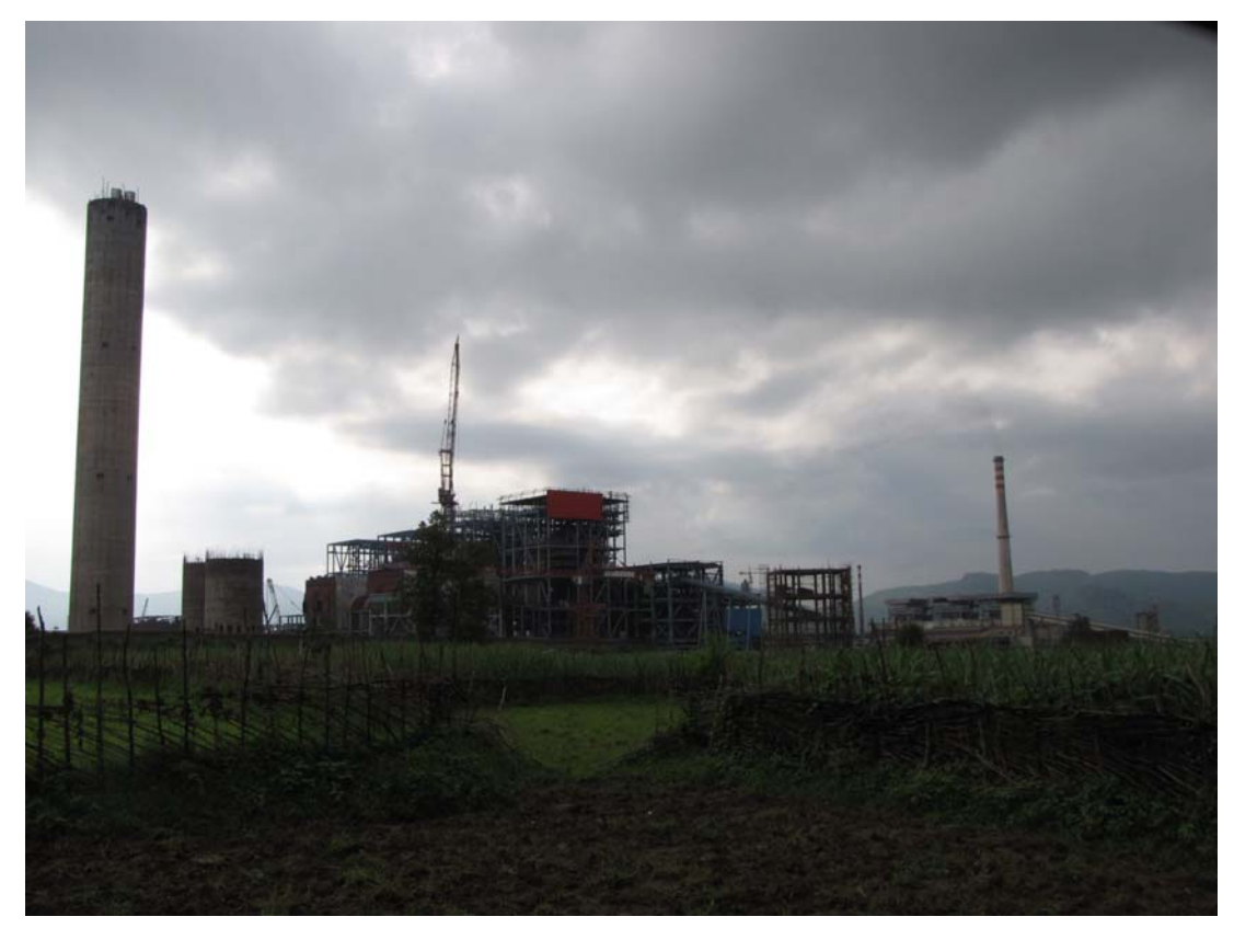
Vedanta Alumina factory showing illegal chimney and other construction