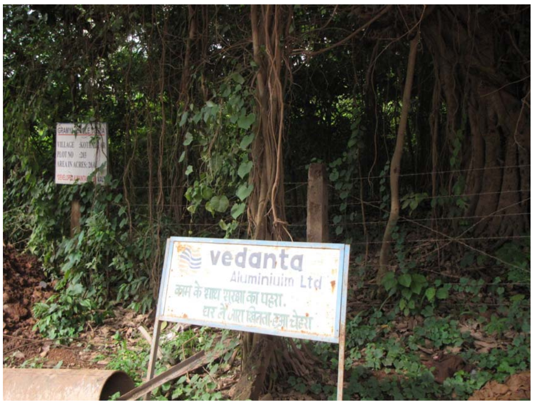
Village forest (gram jogya jangal) illegally taken over and enclosed by the Vedanta refinery