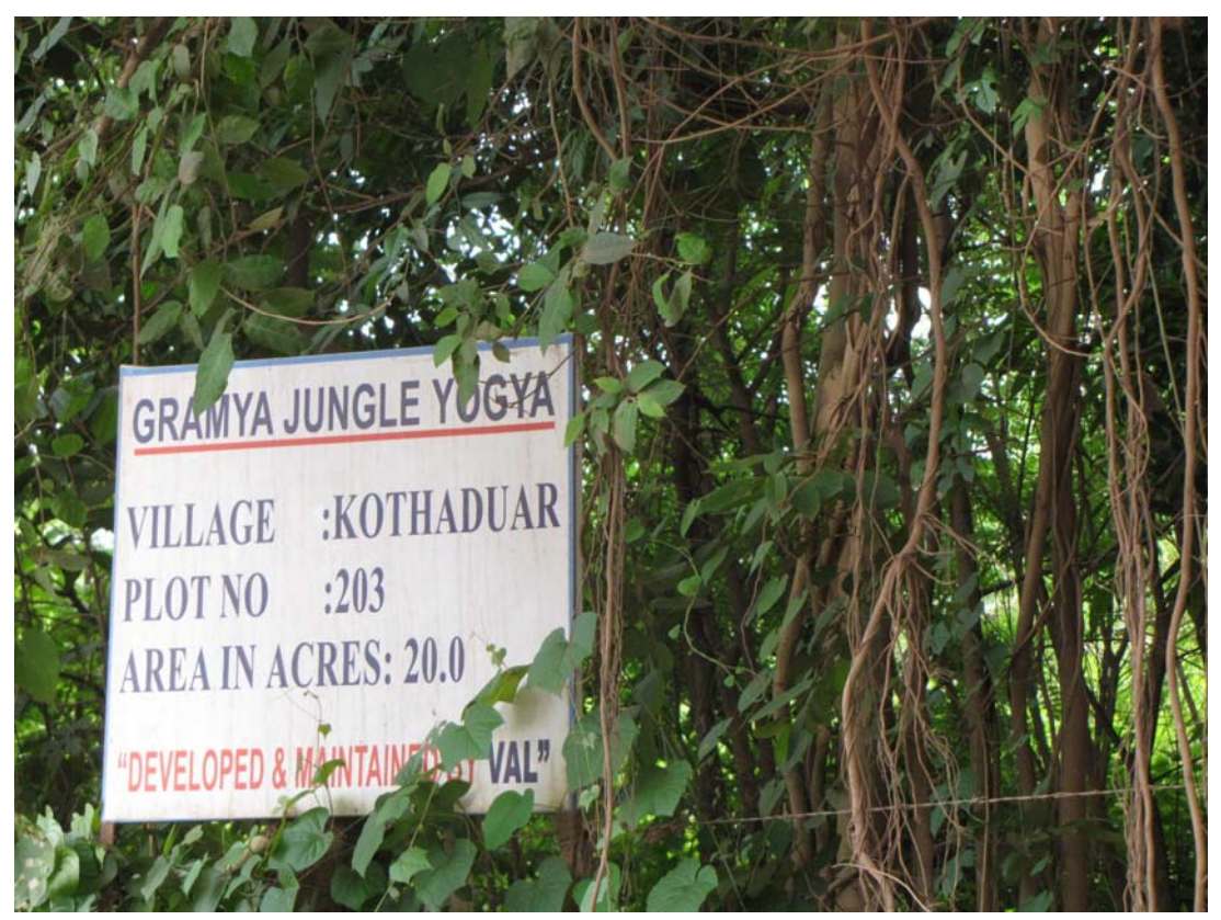
Village forest (gram jogya jangal) illegally taken over and enclosed by the Vedanta refinery