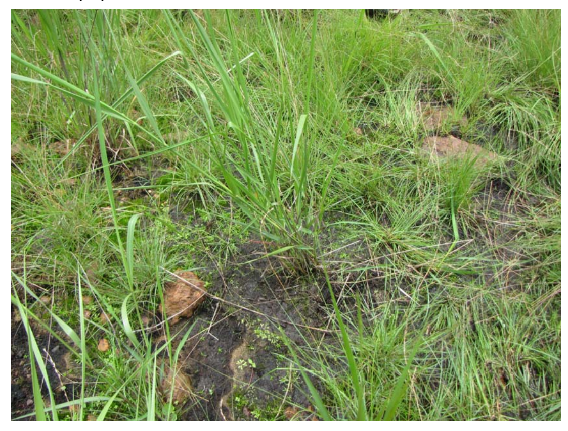
Soil composition, showing water retention and drainage, in the Proposed Mining Lease area

sanctioned proposals, and the state administration seems reluctant to do so.