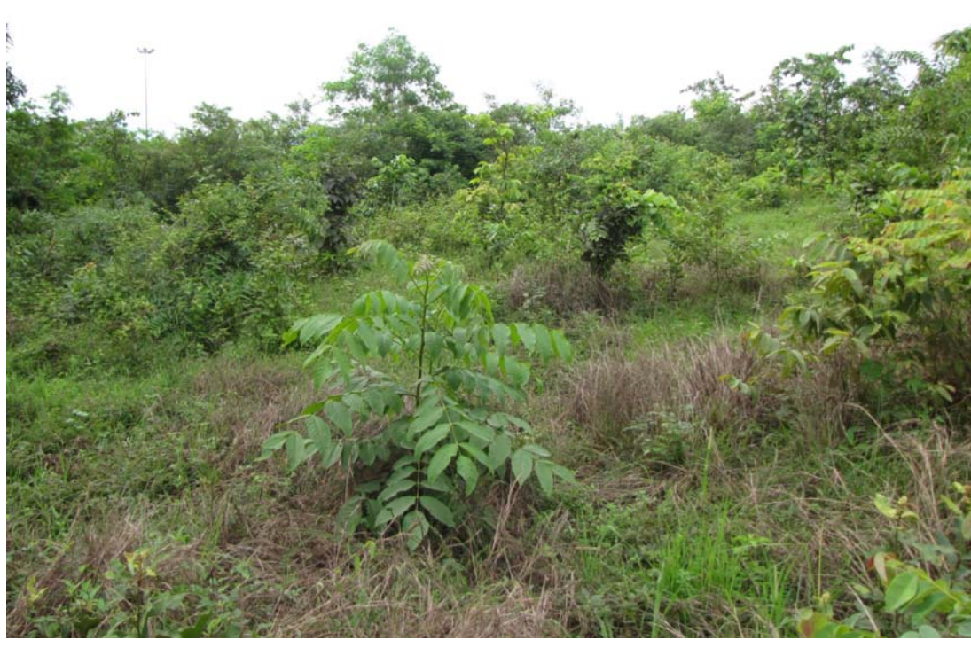
Village forest (gram jogya jangal) illegally taken over and enclosed by the Vedanta refinery