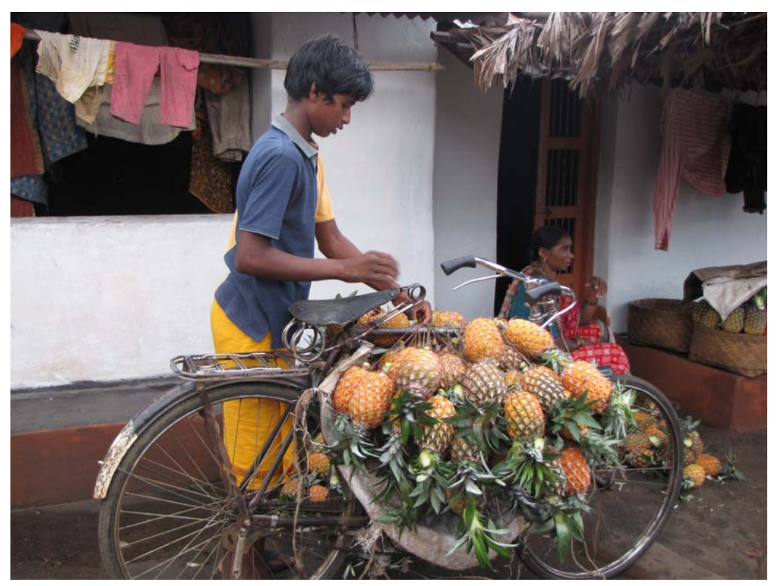
Dalit men and women in Khambesi village, district Rayagada, preparing pineapples grown by the Dongaria Kondh residents of the villages for sale in the local market