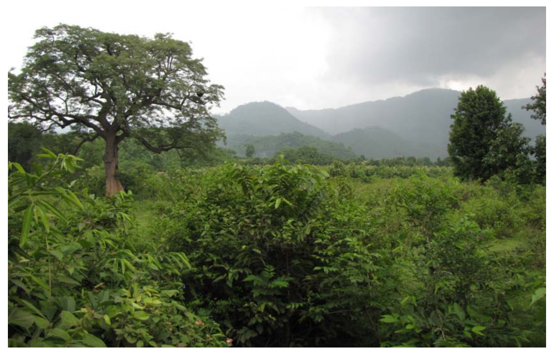
The Niyamgiri hills, Orissa

The PML site itself is largely grassland surrounded by Sal forests which is an edaphic climax<sup>6</sup> for this type of land. Under the Champion & Seth system of forest ecological classification this forest is classified as 3C. North Indian Tropical Moist deciduous Forests – C2e(i). Moist Peninsular High Level Sal. Sal is the predominant crop. Usual associates of Sal in these forests are Terminalia tomentosa , Terminalia chebula , Xylia xylocarpa , Cedrella toona , Pterocarpus marsupium , Adina cardifolia , Syzizium cuminii , Grewia taelifolia , G. elastic , Aegle marmelos , Bauhinia retusa , Colebrookia oppositifolea , Butea monosperma , Careya arborea , Embelica officinalis .