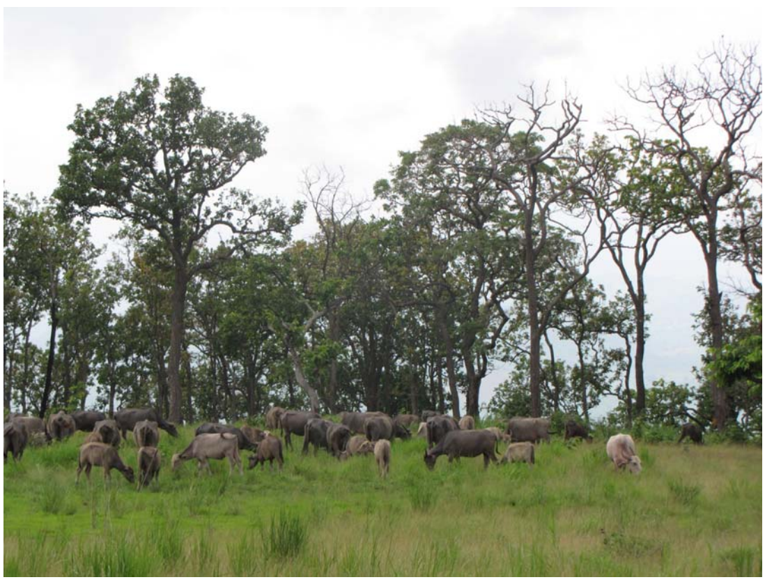
Buffaloes grazing in the Proposed Mining Lease area. Buffalo rearing among the Kondh is not for milk but for ritual sacrifice and meat.