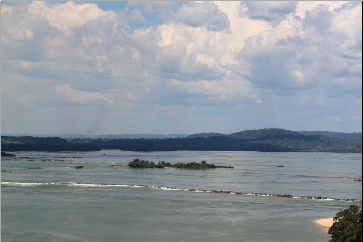
São Luiz do Tapajós Rapids

The Remanso da Anta (Yukpitapodog'ap Dicõð): These backwaters are where, when he was a person, Peresoatpu went to cross the river to the other side of the Tapajós River. He had to transform himself into a tapir to cross the river. His nephew would hunt with his uncle when he was not transformed into an animal. Every time Peresoatpu invited his nephew to hunt and left him alone, he would tell the boy he was going off to defecate. He would distance himself from the boy and transform himself into a tapir, and the boy on seeing him would shout to his uncle, but he in turn would not reply. When the boy reached the village and told his grandmother, she would ask him why he had not speared him. One day the grandmother told the boy to hunt with his uncle and that, this time, he should not call out for him. The grandmother instructed the boy saying, if he saw the tapir this time, he needed to hold onto it with his own hands. The only way to catch it was by putting his hand inside its anus and taking its guts out. This is what the boy did. But the tapir latched on to the boy's hand and, holding onto him, dragged him towards the river. When it went into the water, the boy didn't have much breath and his uncle (the tapir) said that if he needed to breathe he only had to bite his ear so it would emerge.