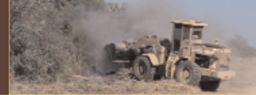
Bulldozers are flattening the forests of the Totobiegosode Indians

and turn it into a cattle ranch. This is a clear violation of both Paraguayan and international law, and will have devastating consequences for the isolated Totobiegosode Indians.