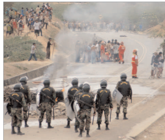
2. A group of people gather around a wounded man, and call on the police to let them evacuate him. The police don't stop, but continue to advance.